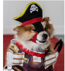
Chouji the Pirate