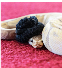
Luna, Ivory and Mystic Snakes