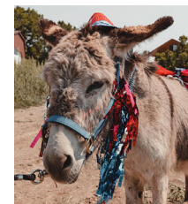
Miss Kitty as 4th of July