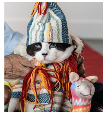
Winchester the Llama Herder

Every contribution, whether small or large, made our 27 th Annual Auction for the Animals another huge success. We appreciate each and every one of you for your attendance and support. We hope to see you all live in 2022!