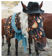
Ranger as Madonna