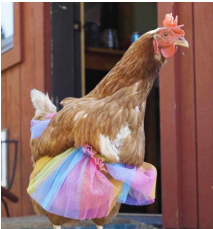
Beatrice and Bonnie the Ballerina Chickens