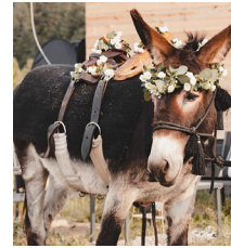
Ace the Wedding Beer Burrow