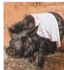
Jojo the Pig in a Blanket