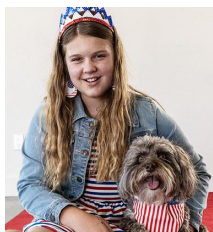
Bogey as Stars & Stripes