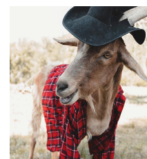
Pinecone the Cowboy