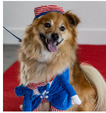
Biscuit as Uncle Sam